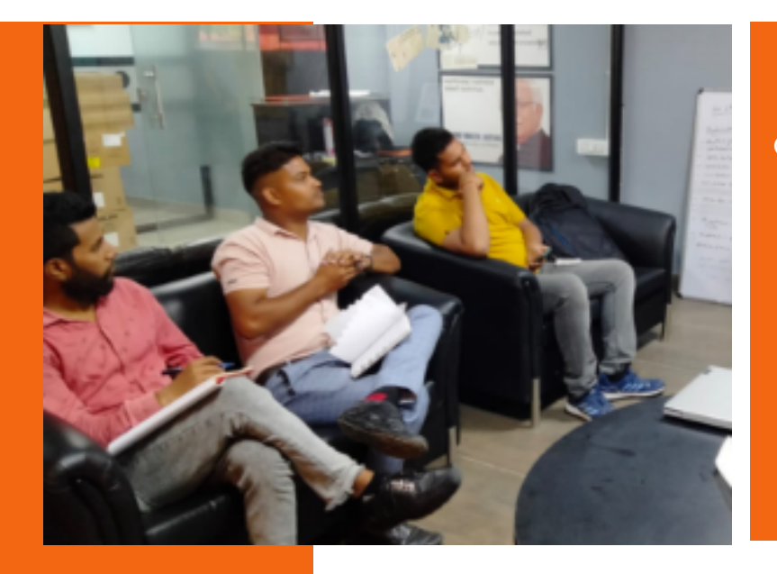
On 25th Aug 2022,Pt. Jawaharlal Nehru College an Interactions/discussion on online plus offline to inculcate startup values with the plans to reach out to the student database by telling their own startup stories.